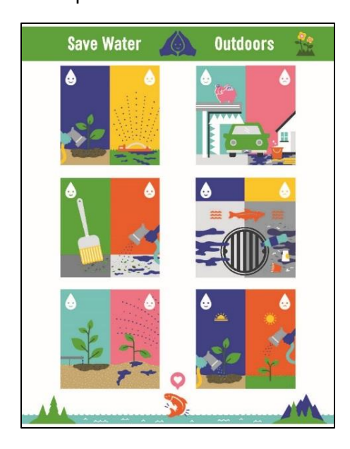
Infographic for school programs

Infographic, a unique image-based tool to teach students "good" and "bad" behavior (with respect to water use) that doesn't rely on words to get the message across. This tool can bridge language barriers and help students and their families understand how to conserve and protect water resources. The infographic will be used in Cascade's classroom presentations.