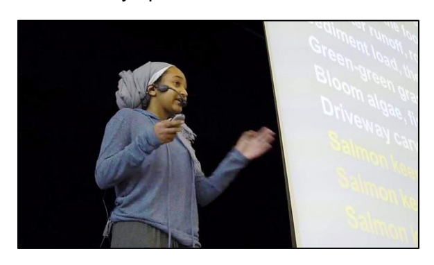
Student presenter at Water Symposium

In November, Cascade held the third annual Water Systems Symposium at the Issaquah Middle School. The symposium is an opportunity for educators to spend a day learning about water issues from local and regional experts. The symposium also includes workshops hosted by Cascade's Teacher Fellows who used their projects to facilitate understanding of problem-based learning. Local students play a prominent role in the symposium.