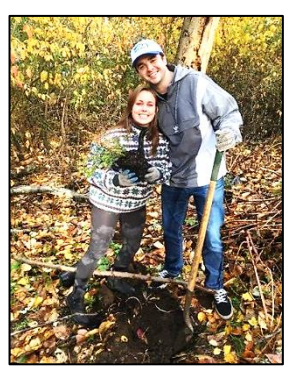
Volunteers at native plant project in Kirkland

in Cascade member areas. Volunteers participated in several projects including McAuliff Park (Kirkland), Hopelink (Bellevue), and the Nameste Garden (Tukwila). In addition, eight WaterSmart Workshops were held in Kirkland, Issaquah, Tukwila, and Redmond.