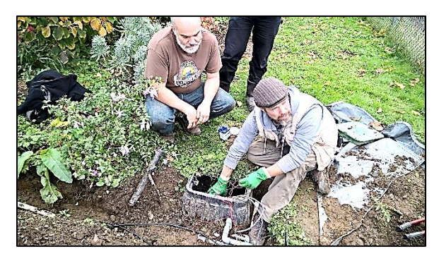
Irrigation system training at LW Tech

Three courses in the Sustainable Landscape Technologies series were completed in 2017. Staff from Cascade members can attend the courses at no charge.