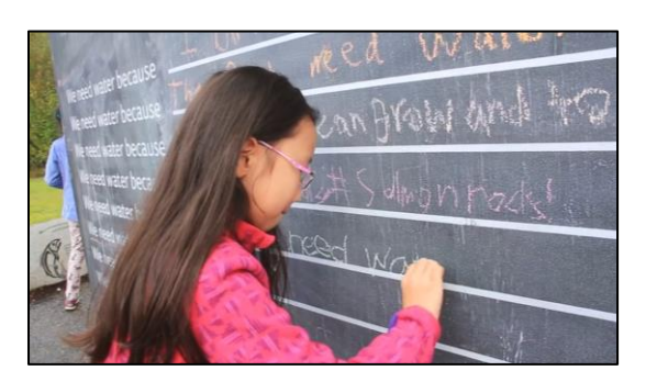
Water Wall at Redmond Derby Days

provided creative and insightful responses on the Water Wall and engaged with staff in discussions about the value of water.