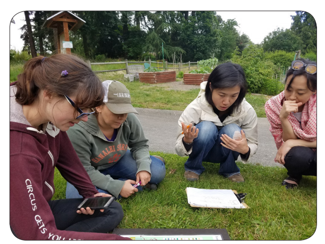
Designing drip irrigation

• Bellfield Office Park, Bellevue – November