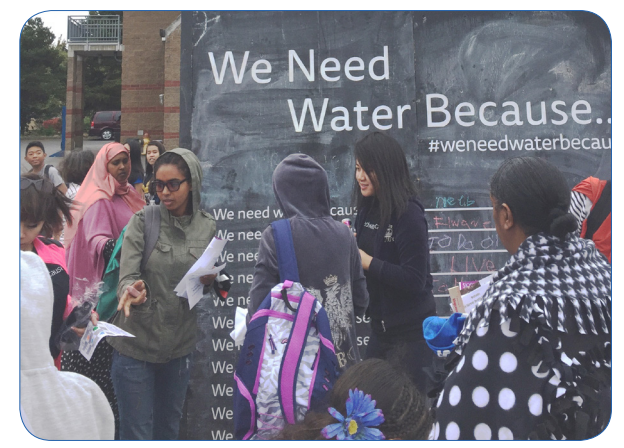
Skyway Health and Wellness Fair

The Water Wall appeared in all Cascade member jurisdictions in 2016.