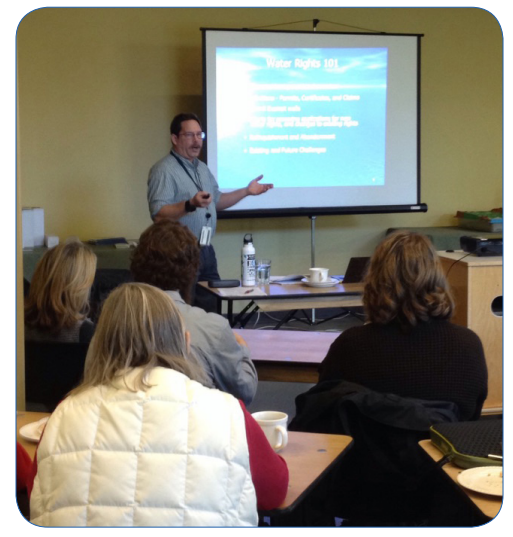
Learning about water rights

Real estate professionals are an important stakeholder, and it is advantageous for Cascade to have members of this industry promoting water efficiency.